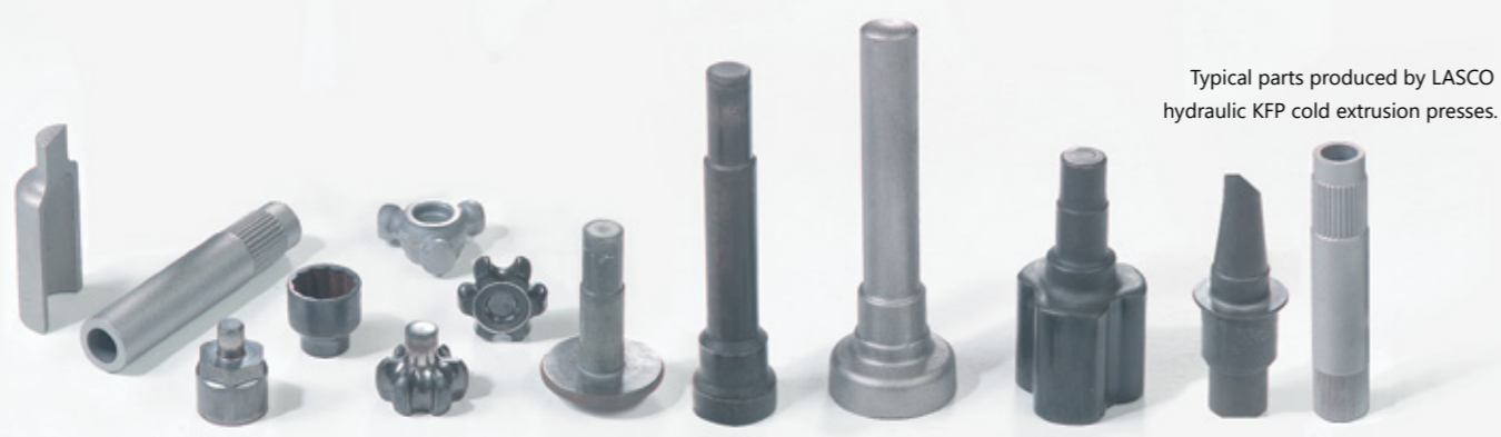
Typical parts produced by LASCO hydraulic KFP cold extrusion presses.