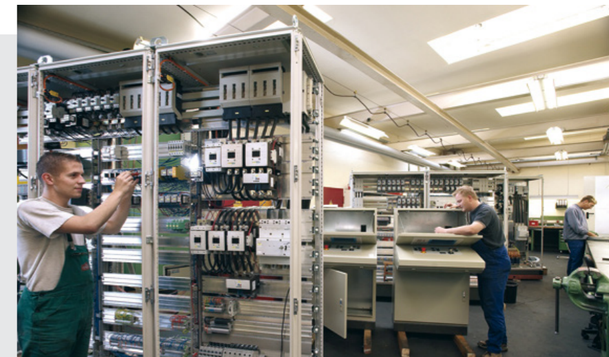
The design, installation, and programming of electronic, electrical, and mechatronic components are core competences of LASCO

The requests of the customer are also considered, when designing man-to-machine interfaces, as well as specific screen menus and charts.