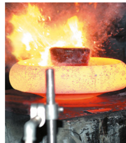
A billet is pre-formed for a ring, on a VPE 800.

Customer preferences will influence the design of the control system and tooling application.