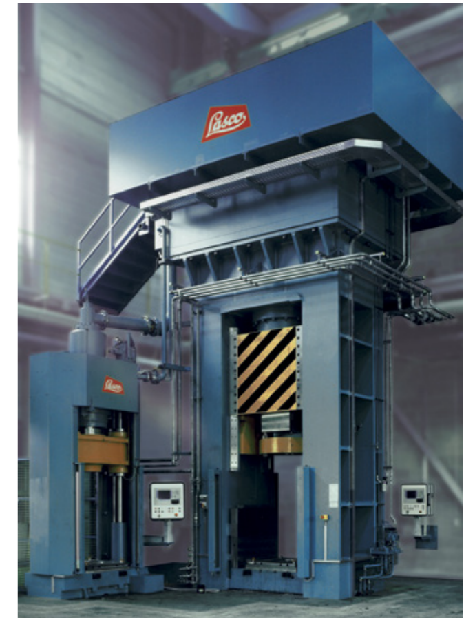
VPE 160 and VPE 500

Demands of the actual process will influence selection of stroke length, ram speed, function and tool area dimensions, as well as frame construction, press drives, ram depth and guidance, and possibility of ejection systems.