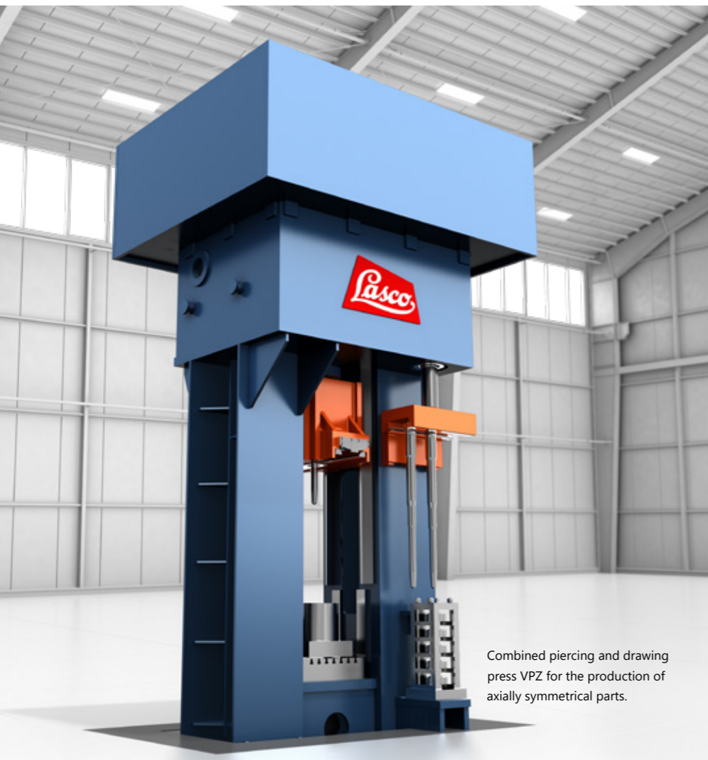
Combined piercing and drawing press VPZ for the production of axially symmetrical parts.

Long, axially symmetrical hollow parts up to an outer diameter of approx. 350 mm and a length of approx. 2000 mm, such as axle tubes, tool joints and gas bottles, are produced on a VPZ - including ironing and indenting - with consistent precision and high output.