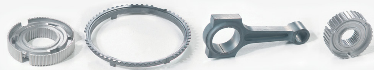
Examples of powder-forged and standard sintered parts that are calibrated on LASCO calibrating presses.