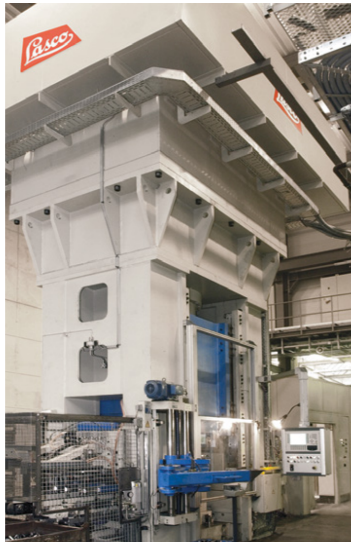
Illustrated is a LASCO KFP cold extrusion press of 1000 tonnes capacity for extrusion of automotive parts.

Characteristics which LASCO incorporate in all their presses are rigidity, ergonomic design, operator safety, ease of operation and maintenance, and never sacrificing long term viability for reasons of cost.