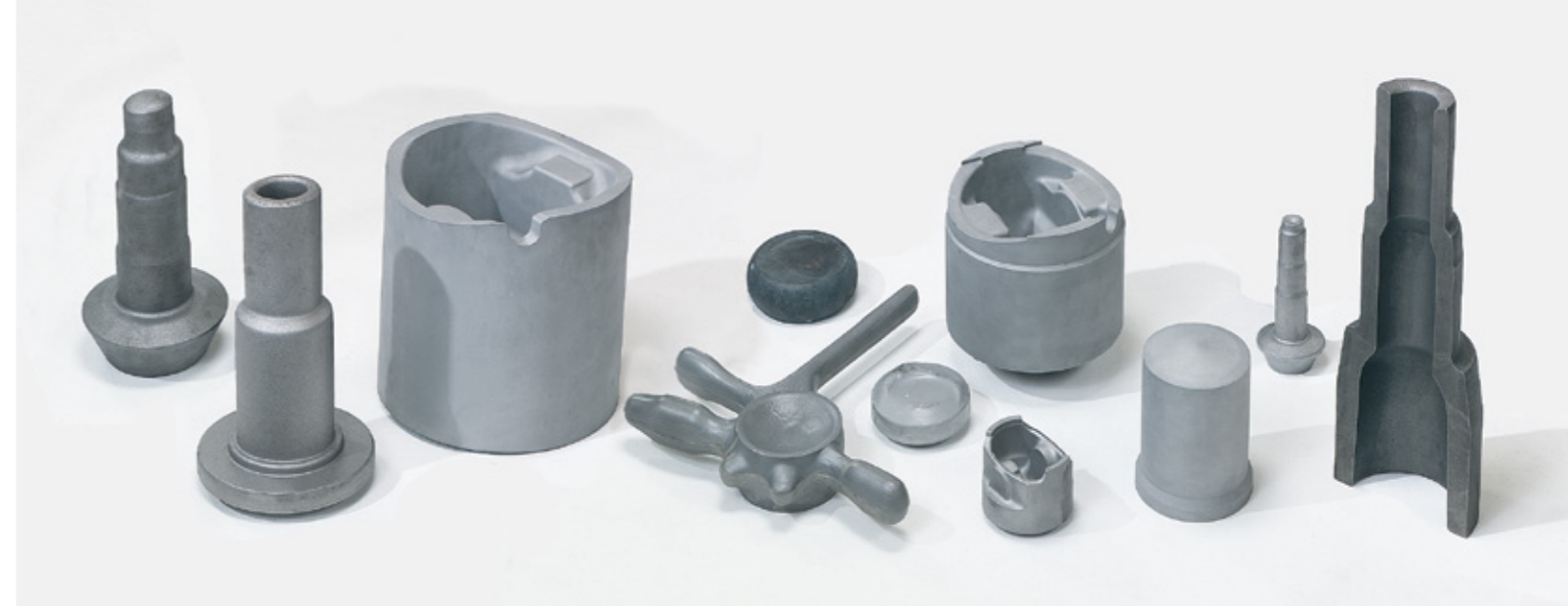
Typical components pre-formed and finish-formed on LASCO VP series presses.