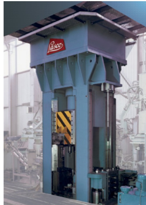
LASCO VPZ in production.

The hot ironing following the hot extrusion process can either be effected with a movable drawing punch, or with a drawing slide.