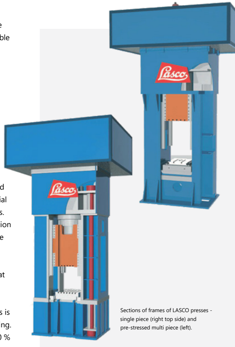
Sections of frames of LASCO presses - single piece (right top side) and pre-stressed multi piece (left).

As well as ensuring longevity of the frame, and forming of more accurate parts, overall size and weight of press may be reduced.